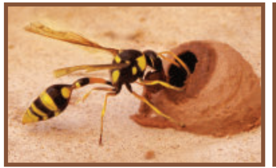
She makes little pots of mud.