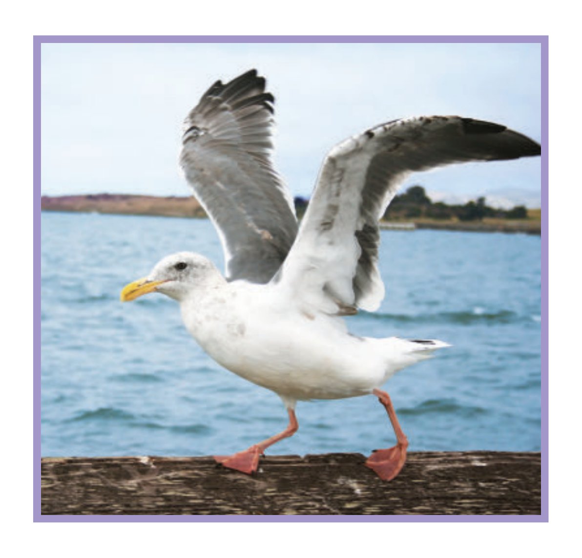
The gull lifts off.