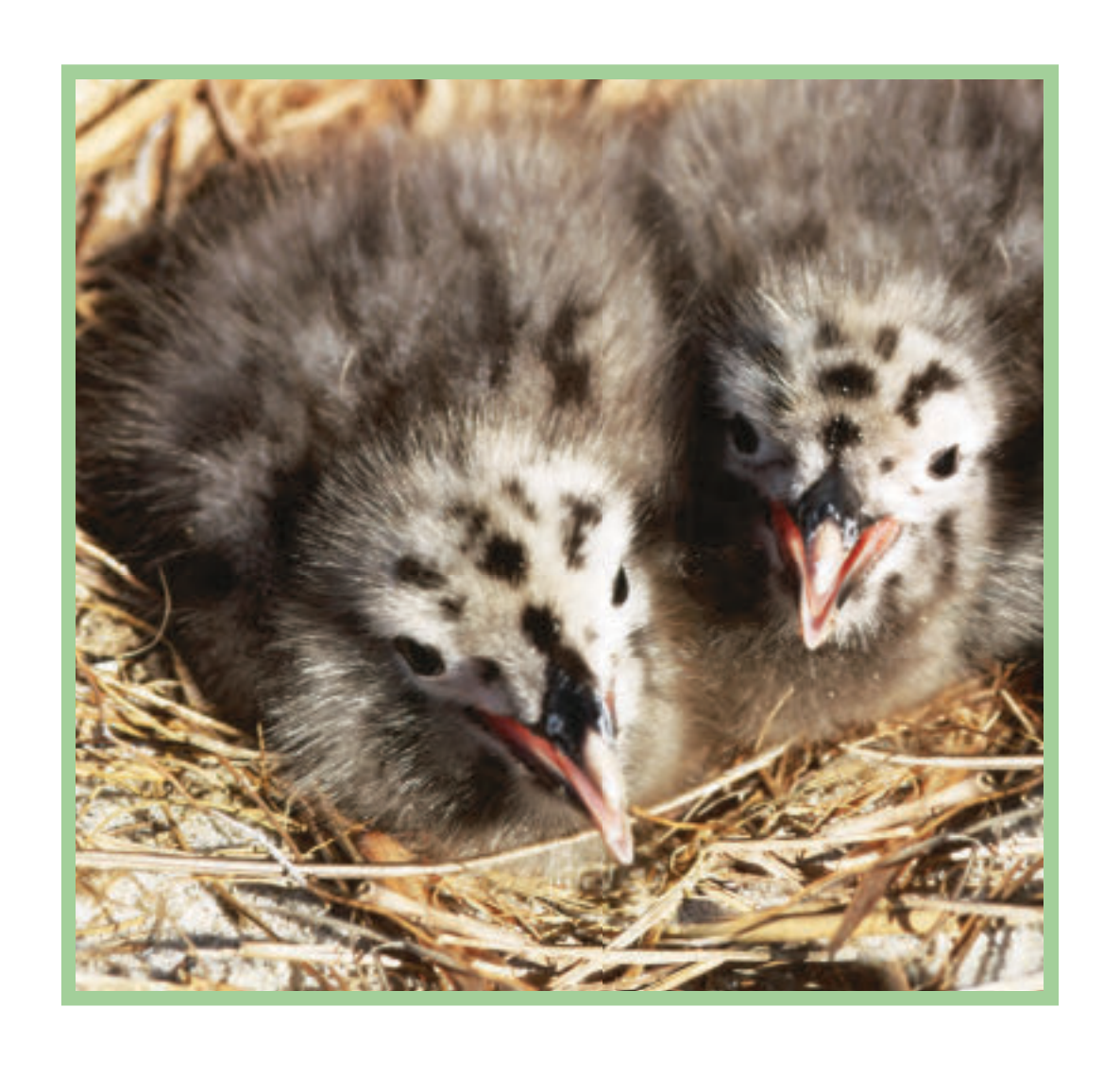
The gulls fuss.