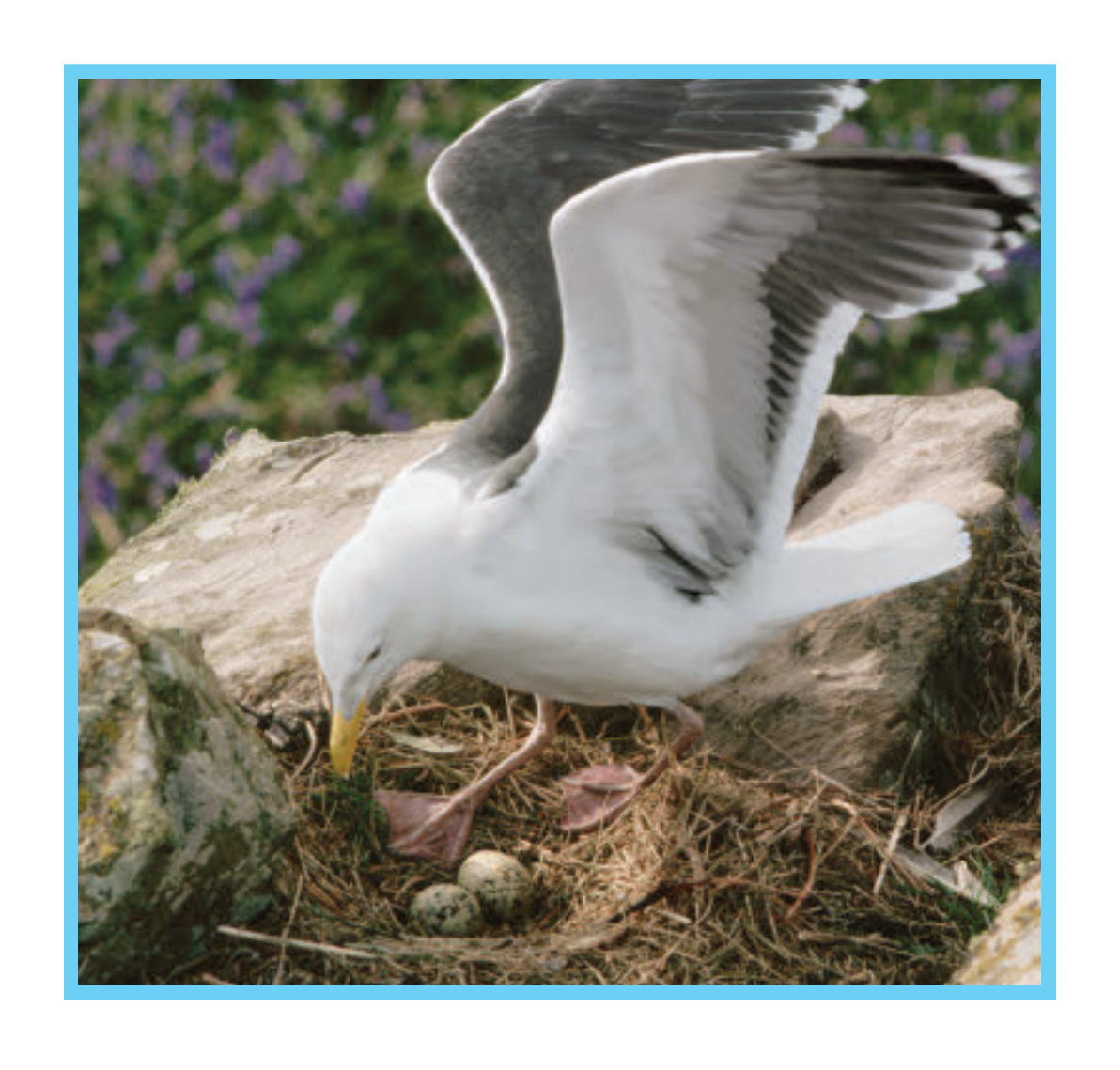
The gull has eggs.