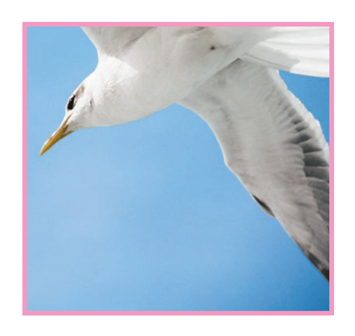
The gull is fast.