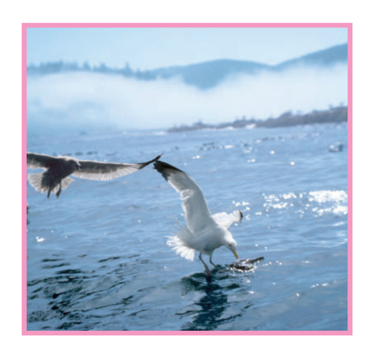
The gull tugs.