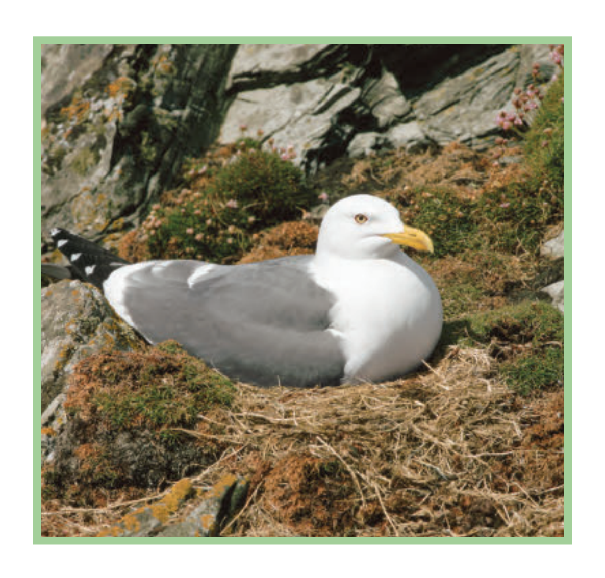
The gull sits still.