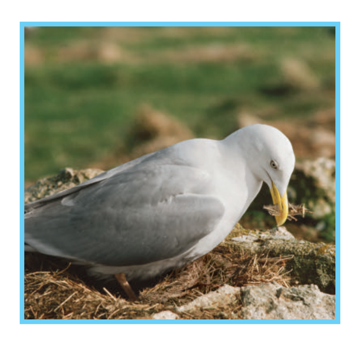
The gull adds fluff.