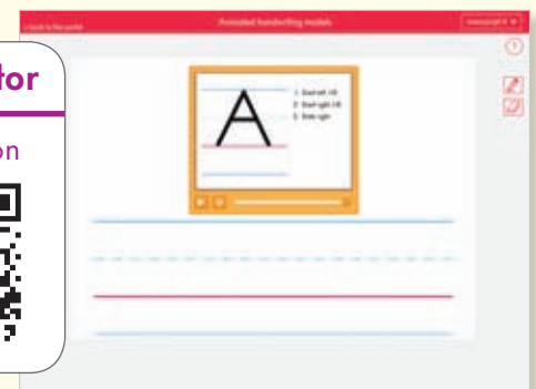
Animated Letter Model