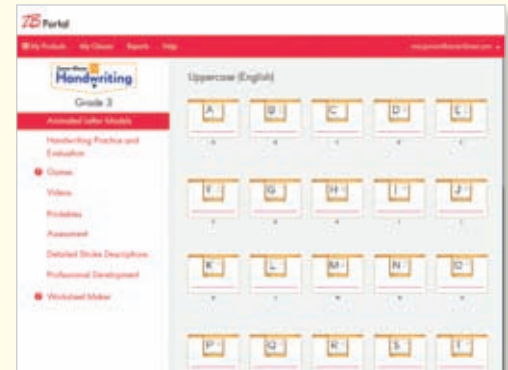
My ZB Portal